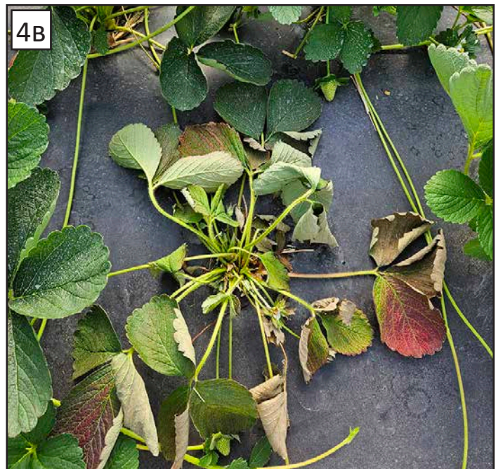
FIGURE 4. CROWN ROT SYMPTOMS INCLUDE REDDENING OF OLDER LEAVES (A) AND STUNTING OF YOUNGER LEAVES; PLANTS ULTIMATELY WILT, COLLAPSE (B), AND DIE.