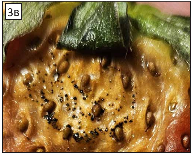
FIGURE 3. SPOTS ON FRUIT ARE SUNKEN AND IRREGULAR (A); SHINY, WET-LOOKING FRUITING BODIES (ACERVULI) DEVELOP IN CENTERS OF LESIONS DURING WET OR HUMID WEATHER (B).