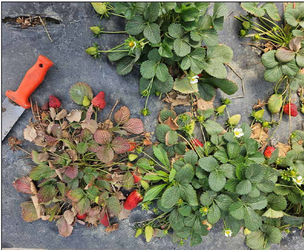
FIGURE 1 NEOPESTALOTIOPSIS (NEOPEST) DISEASE AFFECTS ALL STRAWBERRY PLANT PARTS, INCLUDING LEAVES, FRUIT, CROWNS, AND ROOTS, RESULTING IN REDUCED YIELDS AND PLANT DEATH. SYMPTOMS CAN EASILY BE CONFUSED WITH OTHER STRAWBERRY DISEASES.

Leaf symptoms can easily be confused with other strawberry diseases, such as leaf blotch, Phomopsis leaf blight, common leaf spot, Cercospora leaf spot, or leaf scorch. However, only Neopest disease symptoms include the presence of acervuli.