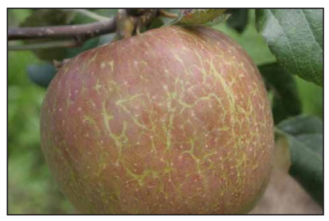
FIGURE 7 . EARLY INFECTIONS OF APPLE FRUIT RESULT IN NET-LIKE RUSSETTING AS FRUIT MATURES.

severely infected leaves drop prematurely. Fruit may be misshapen, fail to color properly, become russetted (FIGURE 6), or split open. Infected fruit often have a shortened shelf-life when outer cuticles are injured. Fruit of many vegetables do not become infected, but powdery mildews can still reduce yield and/or quality. For example, pumpkins and winter squash have a shorter storage-life when stems and handles are weakened by powdery mildew.