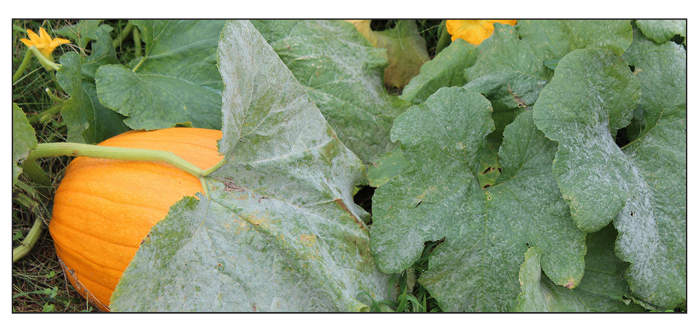
FIGURE 1. POWDERY MILDEW ON PUMPKIN FOLIAGE.

Powdery mildew is easily identified by the presence of white, tan, or gray powdery fungal growth (mycelium and spores) that is present primarily on surfaces of infected plant parts. Immature plant parts are often most susceptible. Affected leaves (FIGURES 1 to 3),